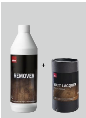
For matt lacquered floors

Allow at least 3 weeks before using strong alkaline cleaning products.