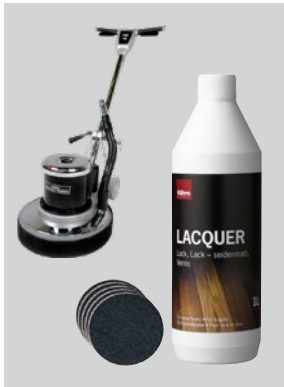
For satin lacquered floors

The main reason for re-lacquering is that after many years' use, the floor needs to be "freshened up".